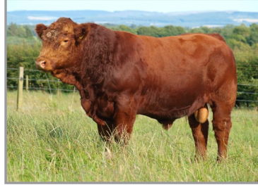
Dirnanean Yukon PP Maternal Grandsire: Dante and Delaney. Pictured at 16mths.