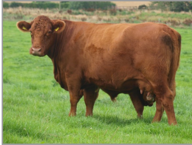
Dante's mother—A17 P (above)