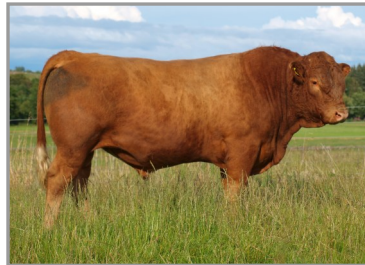
Dirnanean Yucatan P (at 16mths) sire of Darcy's mother.